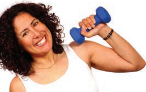
KEEP YOUR INNER BALANCE

We hear or perceive the word »stress« at every step. Regardless of what type of threatening factor is a stressor, an organism always reacts in the same way, with an »alarm reaction,« which is also known as the fight-or-flight response. Stressors may be physical (noise, dust, shift work), psychological (time pressure, worries at home and at work, etc.), mental (feeling overwhelmed), or social (unemployment, new job, new residence, etc.). In stressful situations an alarm goes off in the brain and stimulates the adrenal gland, which increases the release of hormones (adrenaline, noradrenaline and cortisol). The heart starts to beat faster, the breathing accelerates and blood pressure increases. Blood flows away from less crucial organs (the skin, digestive organs) toward the vital organs and muscles. Physical activity can decrease the symptoms of stress and depression and has psychological and sociological effects on health. Stress can be caused by both positive and negative events that destroy our balance.