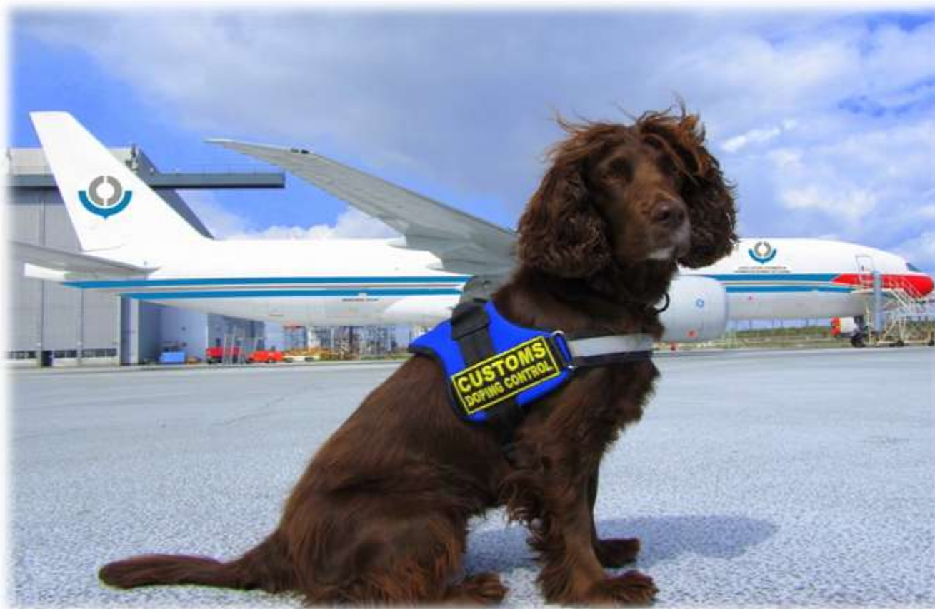
"Chili" Denmark's first DOPING dog

Denmark's first DOPING dog! "Chili" is an experienced sniffer dog. Now, she is also trained in finding anabolic steroids and other kinds of doping substances!